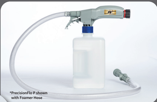
*PrecisionFlo P shown with Foamer Hose