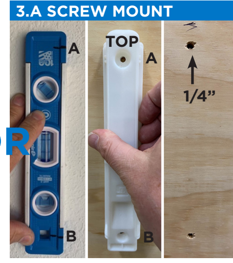
MARK and DRILL top and bottom holes.