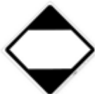
Limited Quantity Ground