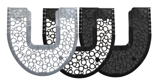
Keeps floors clean around toilets and urinals